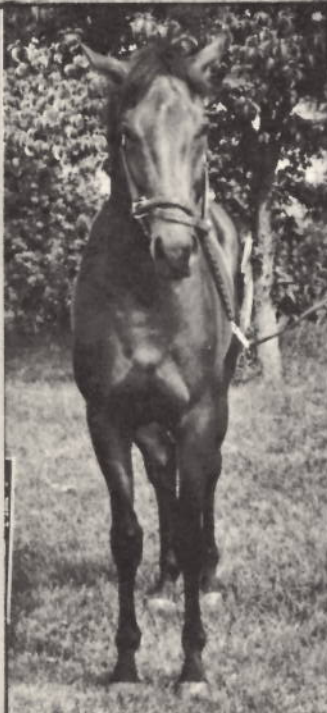
LEFT HIND LEG