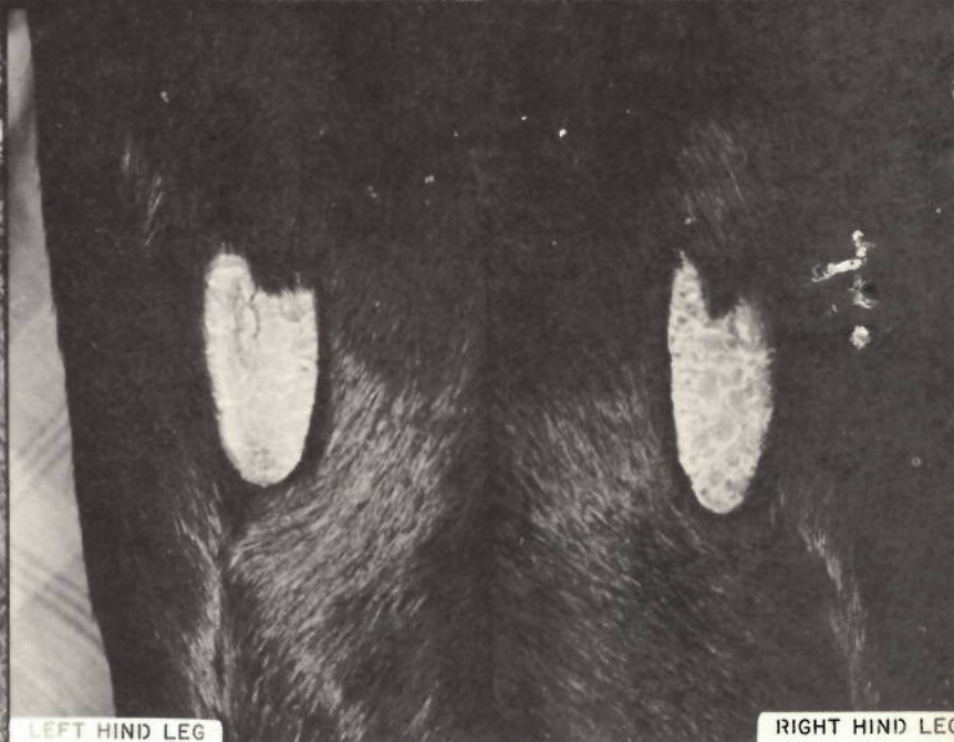
RIGHT HIND LEG

NEW YORK STATE RACING COMMISSION TO THE SECRETARY OF STATE